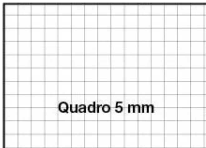
Math Workbook 3-5 grades