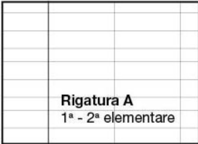
First and Second grade lines