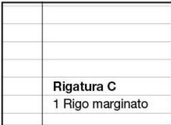
Fourth and Fifth grade lines