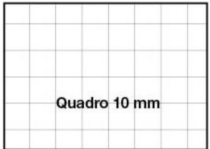
Math books 1-5 grades